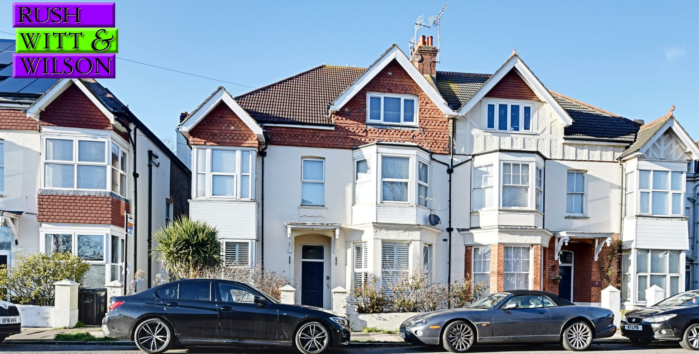
Ground Floor Flat, 44 Wickham Avenue, Bexhill-On-Sea, East Sussex TN39 3ER £262,500